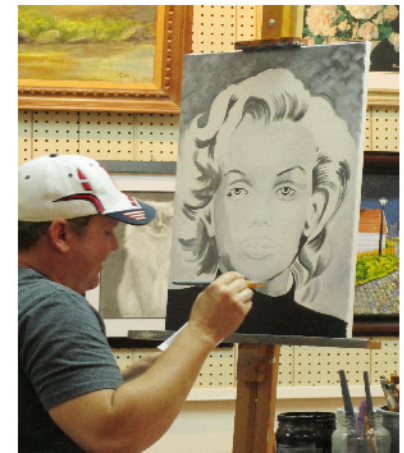
Continuing with mid and lighter tones.