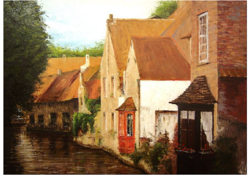
'Belgium' by Tiago Finato