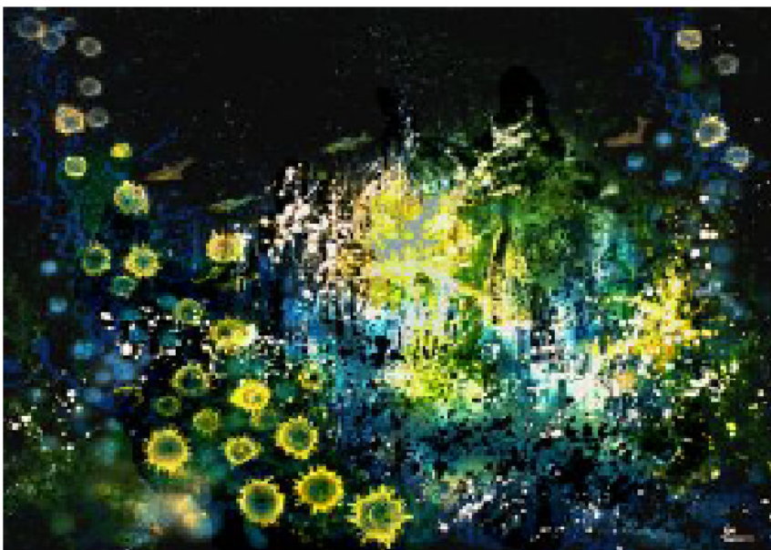
'Deep Under Water' by Gil Carvalho