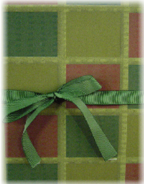
Hand-Stitched Book sample

Registration for the Spring Art Show & Plant Sale is May 14 & 15. Please refer to your April Newsletter for registration guidelines.