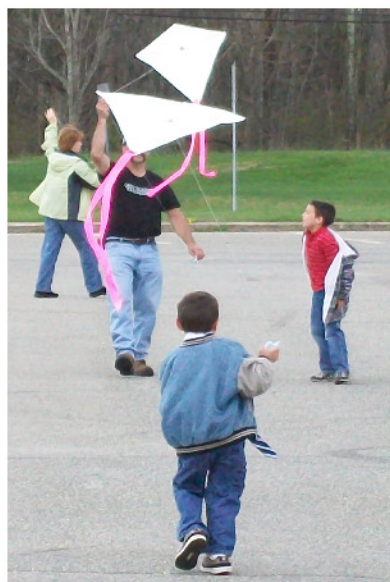
Kids as well as adults had a great time flying their kites!