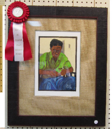
Spring Art Show 2013