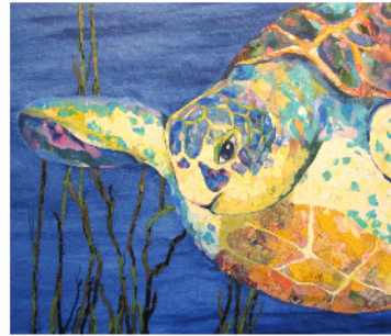
The turtle is all paper except for the water.