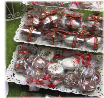
Homemade confections by Chocolate Madness.