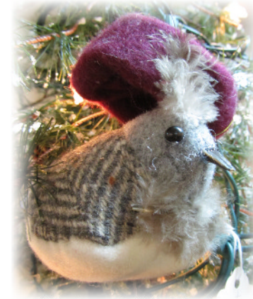
Hand sewn bird by Woodland Woolies.

The annual Shades of Winter arts and crafts fair was held on Dec. 3 & 4.