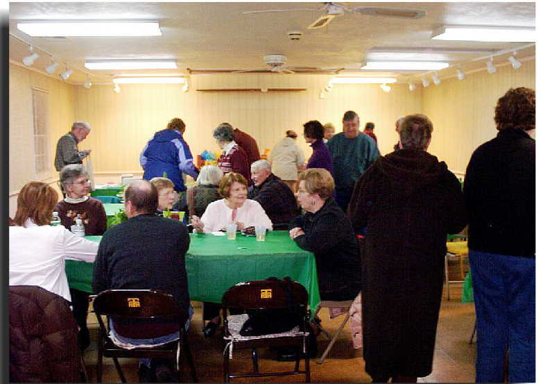
Guests arrive at the annual Pot Luck Supper.