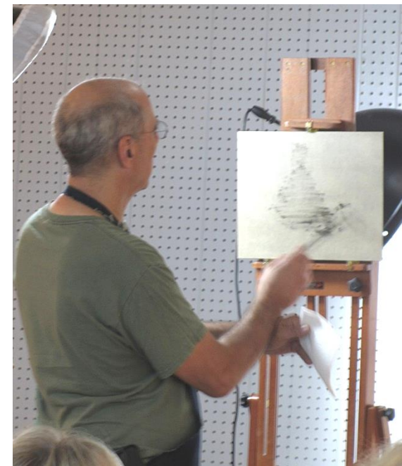
Blocking in the shapes with paint.

One of the most important things to do is to view your reference material as a representation of your art, not to make your art a representation of your reference material.