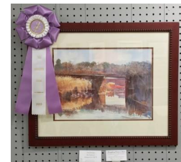
Principles of Value & Color Sis Denson – Fall Bridge (watercolor)